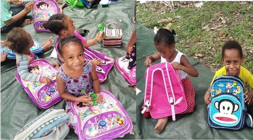
Kids from Mercy Care Grammar showing their appreciating after receiving their back to school packs.