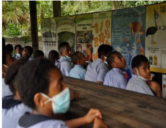
Below : display pictures from the water usage stall where the lady talked to the students on how to use water wisely.