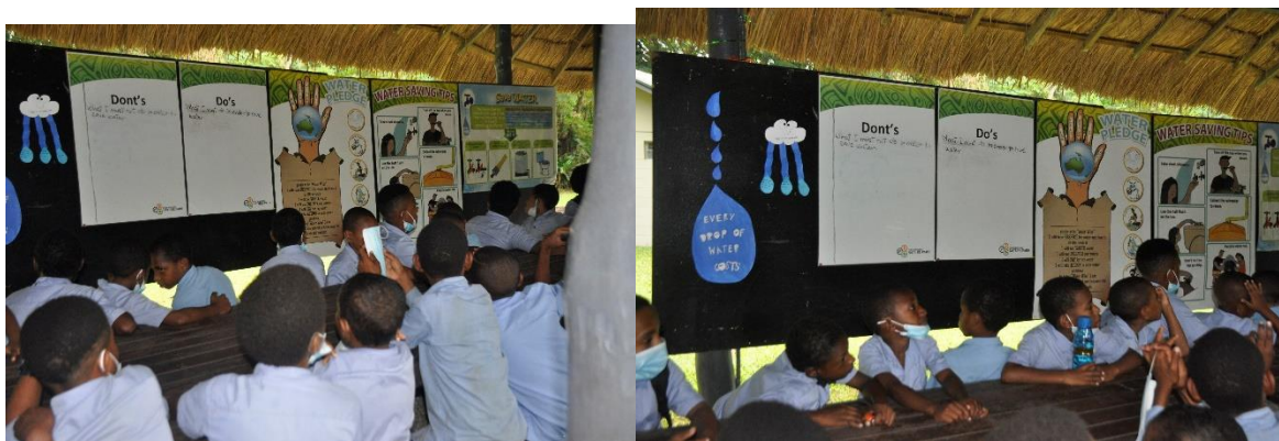
Other pictures showing students enjoying after their tour around the park.