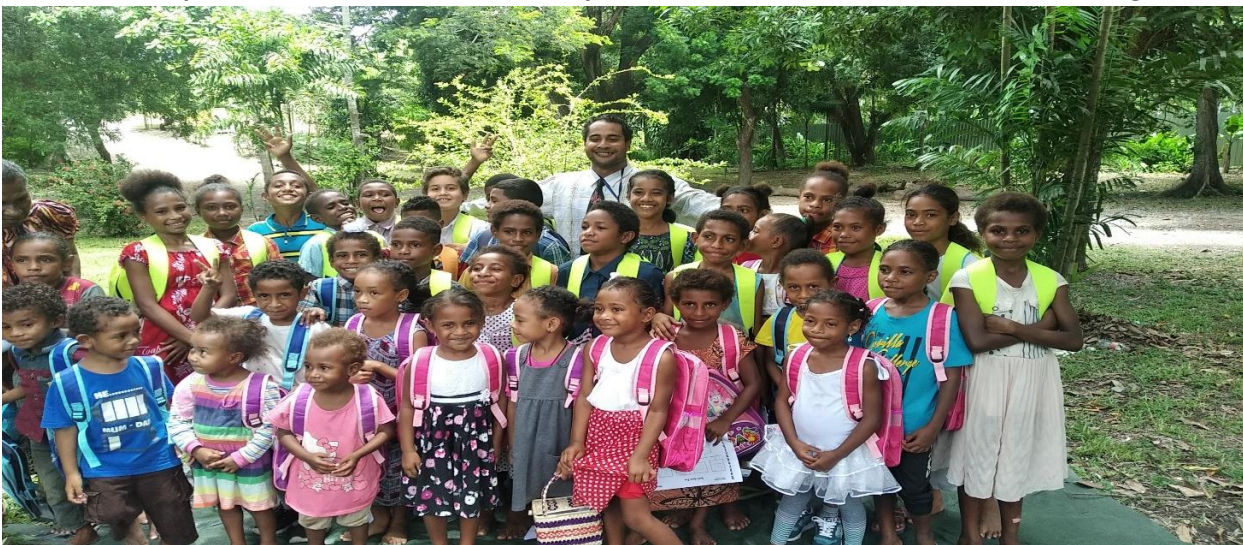
Kids from POMCOC with big smiles after receiving their gift packs

Find below pictures of kids from Mercy Care Grammar & POMCOC receiving their gift packs.