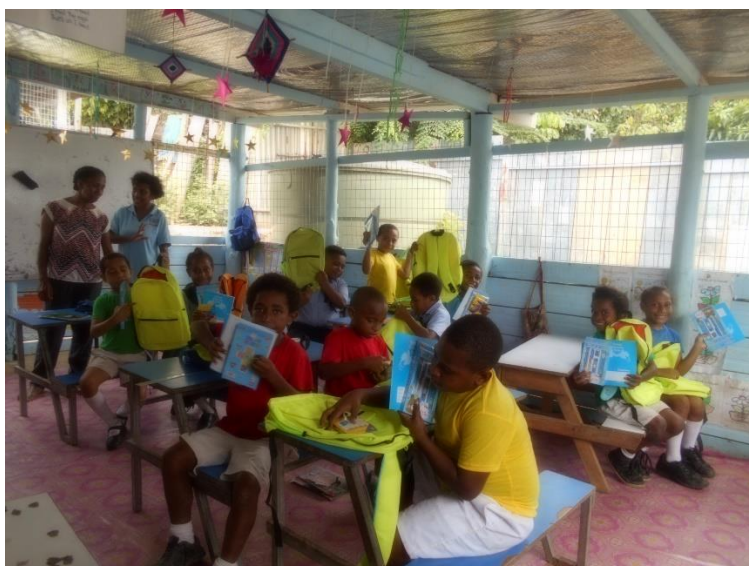
Grade 2 students with their new back packs and stationary.