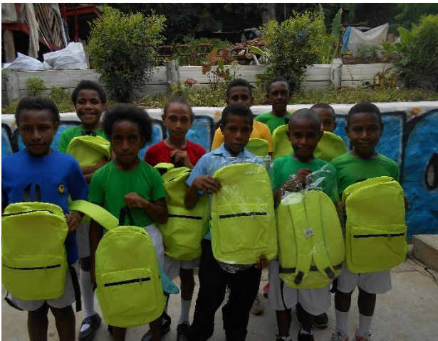
Grade 3, 4 & 5 students holding their gift packs.