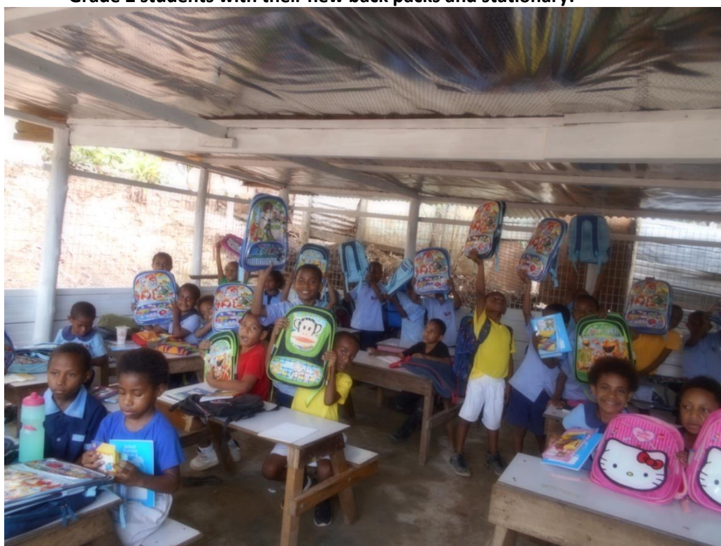
Grade 1 student showing their excitement receiving their new back packs.