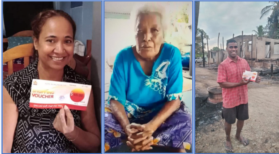
Families in Lautoka, Suva and Nadi benefitting from the Food Voucher program.

Liti Ratunivabea serves as the HOPE rep in Fiji and continues to mobilise volunteers from the Suva and Nadi Churches of Christ to serve their communities through various programs. This includes the Food Voucher program for families living in hunger. The $65 vouchers feed a family of five for a month. The 'HOPE Yaro Village Kindergarten' program has provided essential school supplies to kindergarten aged children on a remote island, accessible only by boat (photos below).