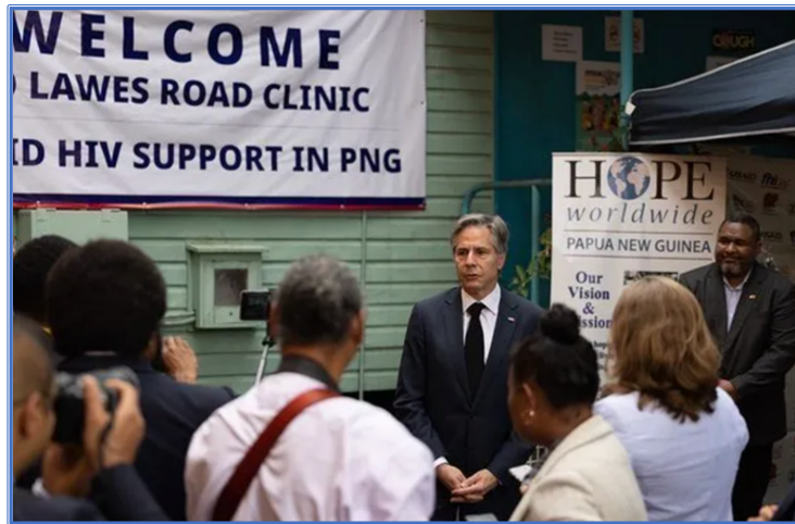
Anthony Blinken at the Lawes Road Clinic in June 2023

An exciting highlight in 2023 was the unexpected visit by the US Secretary of State, Anthony Blinken, to one of HOPE's clinics. After touring the clinic and talking to the staff, he expressed his gratitude for the services delivered through HOPE worldwide: "This was a real privilege to be here at the Lawes Road Clinic where quite literally our partners are saving lives, changing lives, every single day."