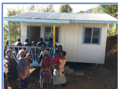
(3) Bokolma Clinic, Gumine