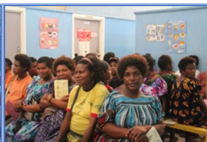
(2) Lawes Road Urban Clinic, Port Moresby