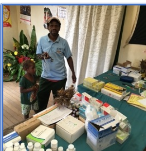
(4) Moroma Clinic, Jiwaka