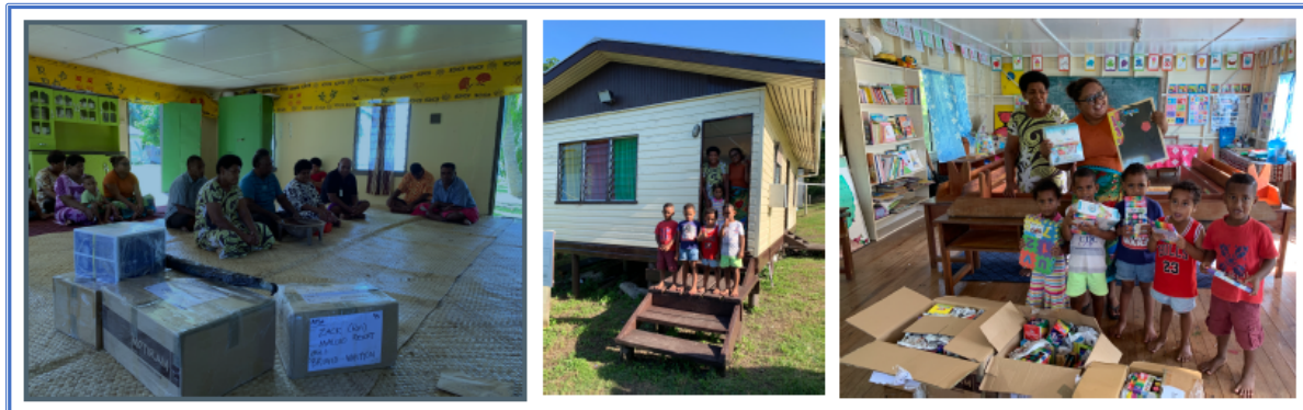
HOPE Yaro Village Kindergarten receiving school supplies in August 2022