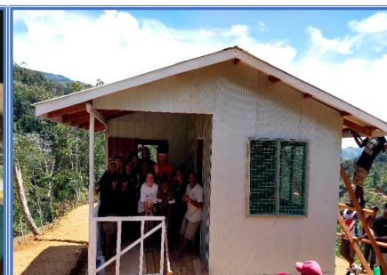
(5) Kalvery Clinic, remote Gumine