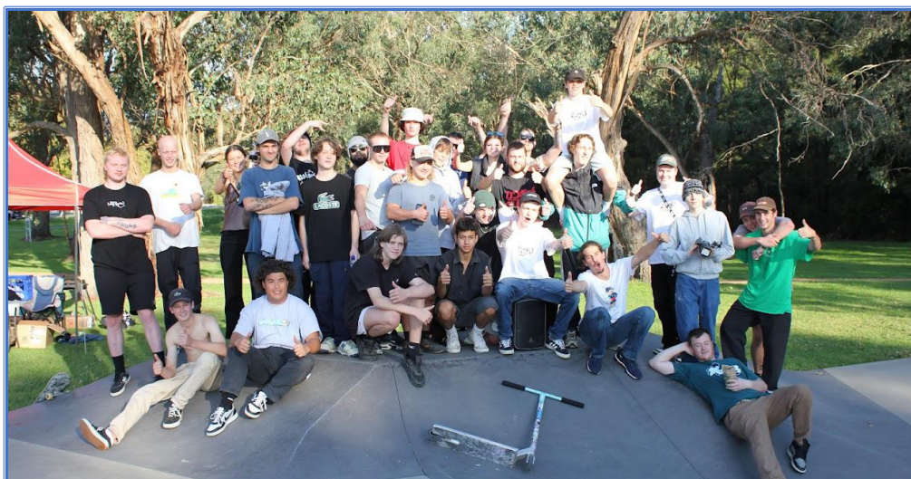
Youth at a Skate Park Outreach Event

HOPE reps have several activities planned: 'Tradie' volunteer trips to PNG, engaging youth in skate parks, singing at Aged Care facilities and meals for the homeless.