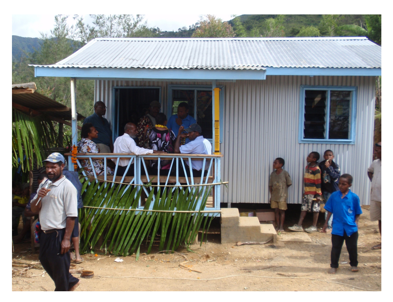
Figure 6 One of the rural clinics, operated by HOPE worldwide PNG- Bokolma Clinic, Gumine, Central Highlands