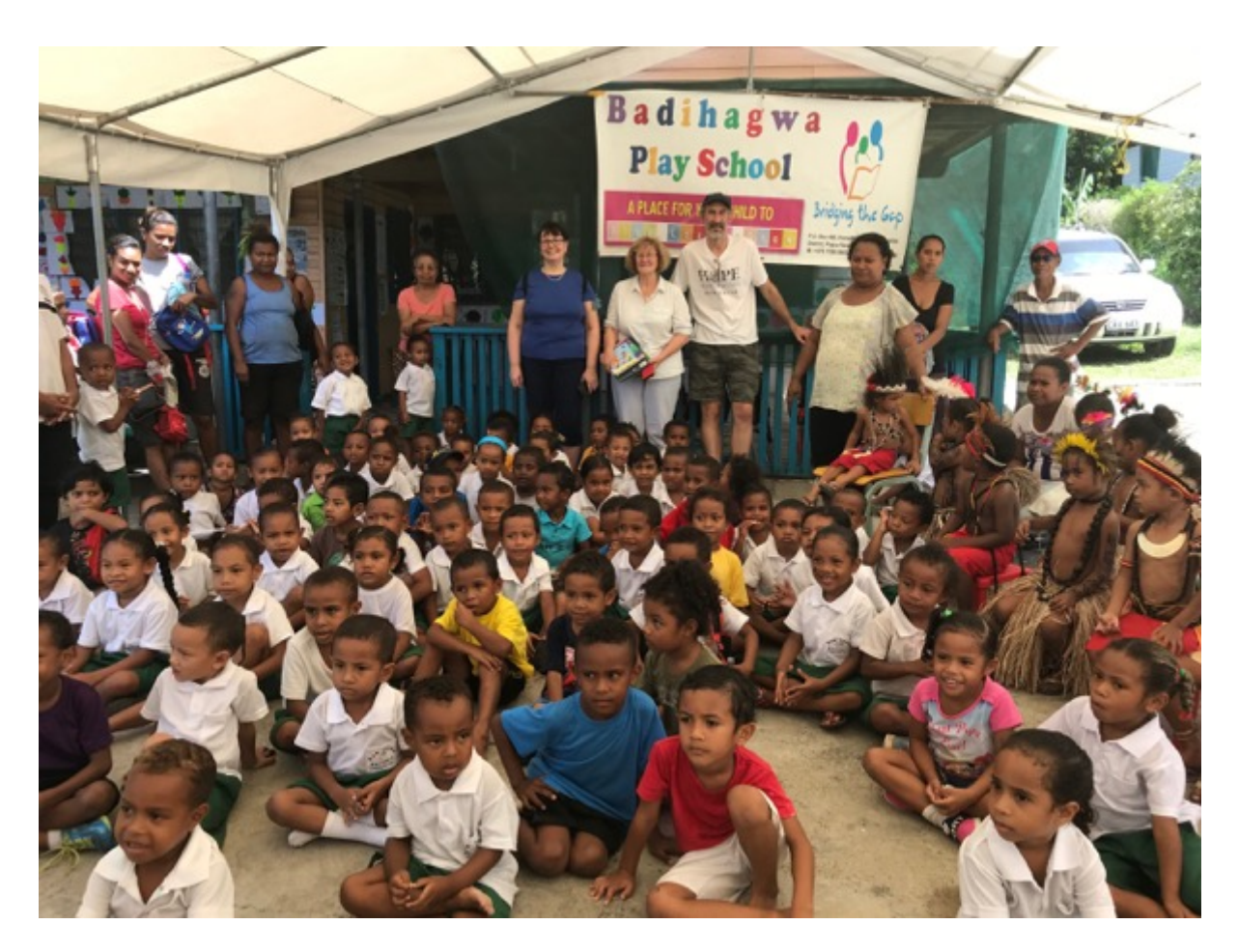
Figure 9 New Literacy program to support early childhood development