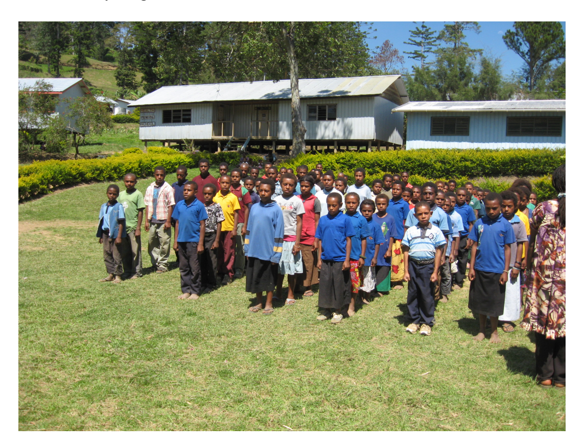
Figure 5 One of the primary schools in Gumine, Central Highlands benefitting from the library program

The School Library Program distributed over 2 million Books nation-wide