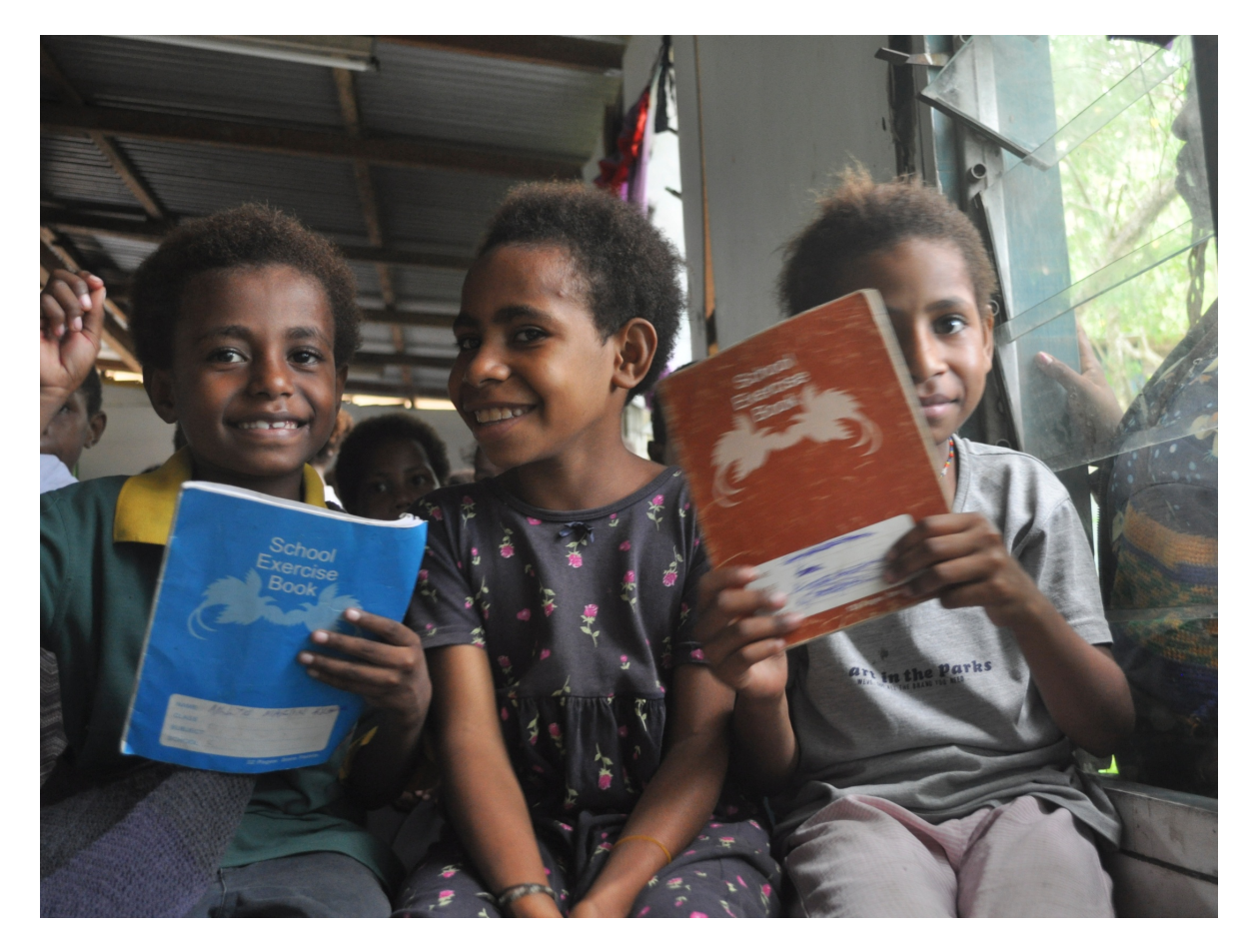
Figure 4 Catch up School that operated at Six Mile