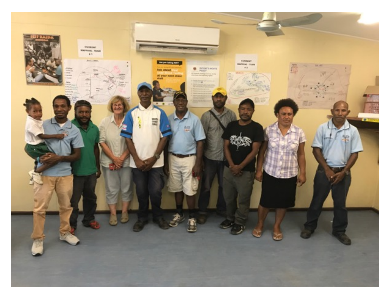
Figure 7 Some of the HIV outreach team at the HOPE clinic at Lawes Road, Port Moresby