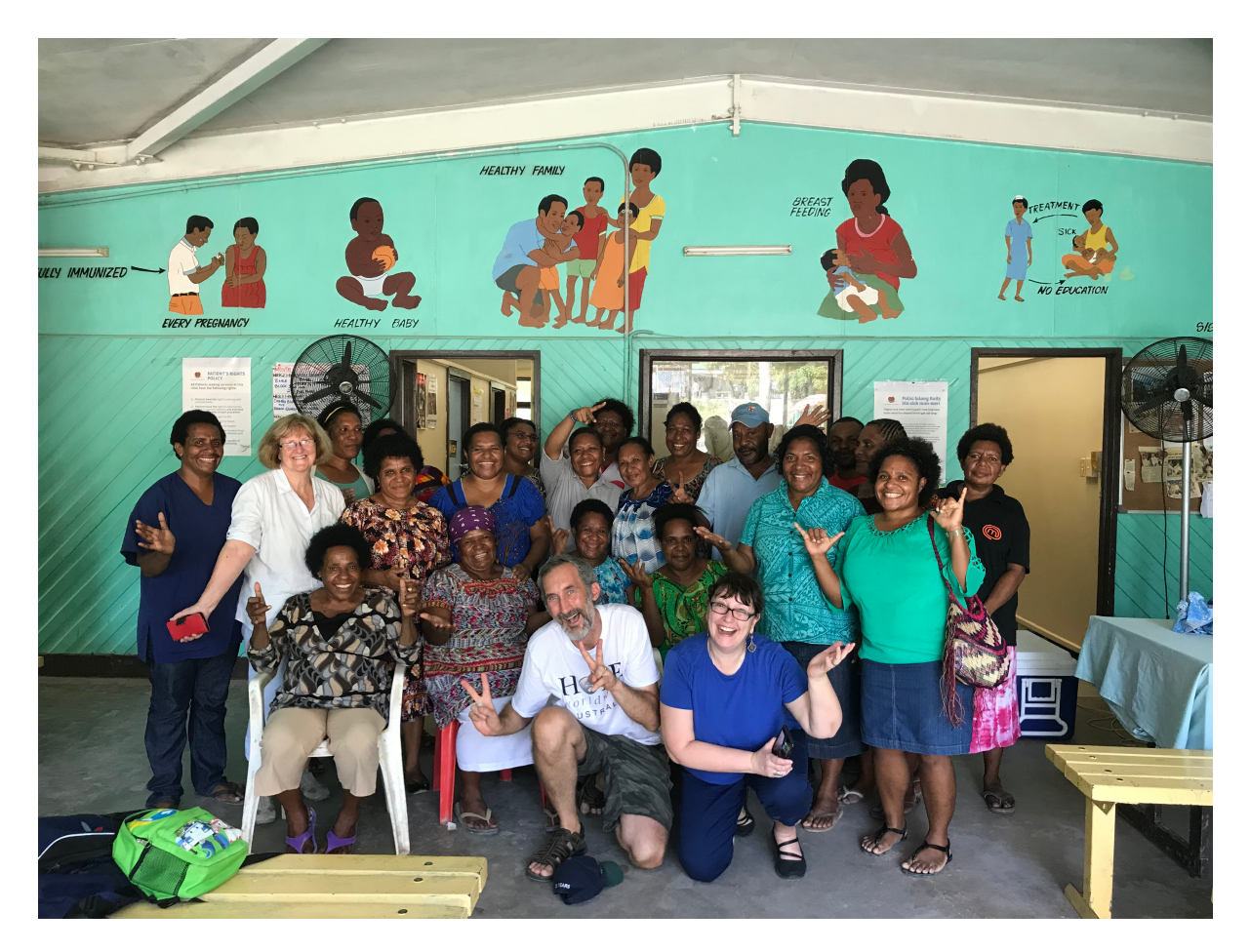
Figure 3 SOme of the current staff at 9 mile clinic