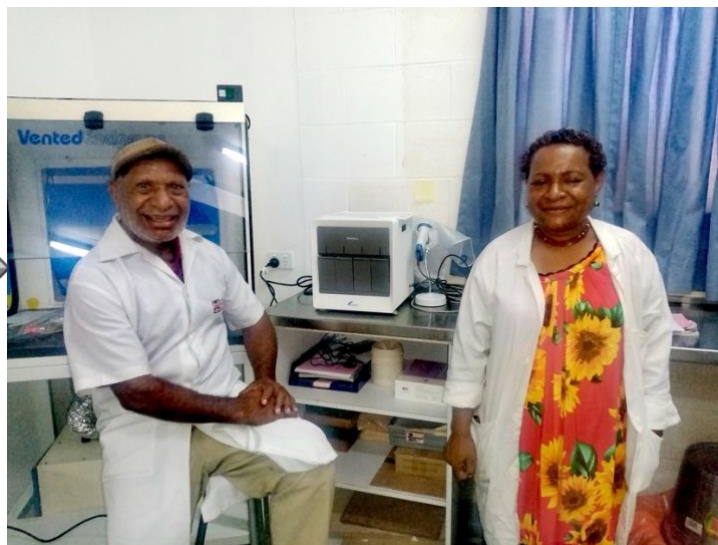
The Laboratory at the 9-mile clinic - able to do STI checks including HIV