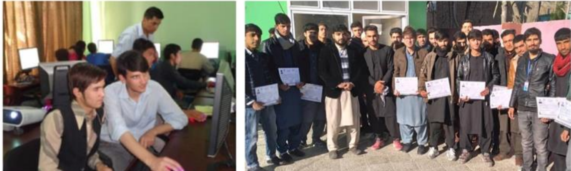
Students at the Community Centre