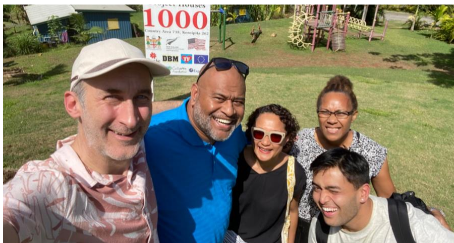
HOPE team visiting proposed house building site, Lautoka, Fiji

One of the programs being planned by the members of the Nadi Church of Christ is to build homes for the Koroipita community who currently live below the poverty line in squatters' areas. Volunteers plan to build one home later in 2022 and then three more in 2023 as part of a Christmas HOPE Volunteers Corps.