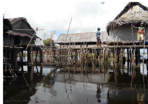
Remote Kambuku and Jangit Villages, Angoram District