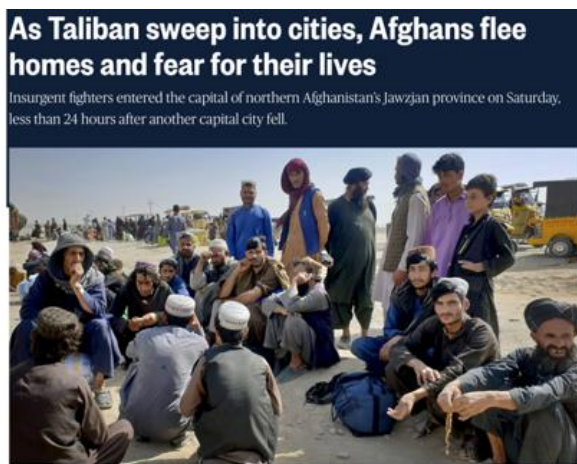
Above: Afghans considering seeking asylum