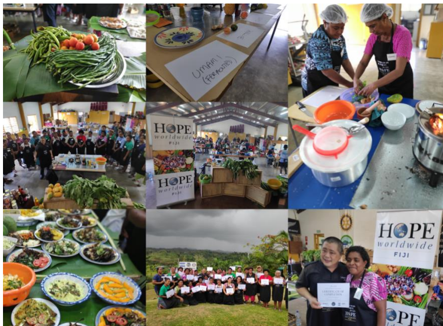
Various job creation programs managed by HOPE worldwide Fiji

These programs have collectively benefitted over 1,500 people since their inception in 2020 and more programs are planned for 2023.