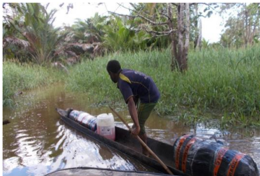
Taking buckets and water filters to the remote Kambuku Village by canoe