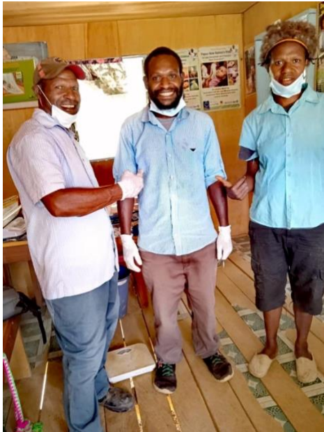
HOPE Staff at the remotest HOPE Clinic in Kalewary, Simbu Province, Central Highlands