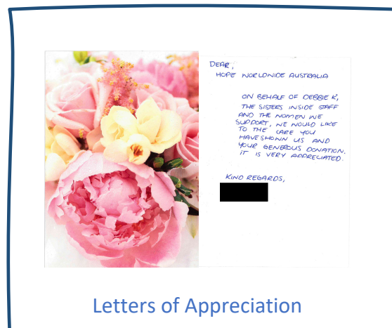
Letters of Appreciation